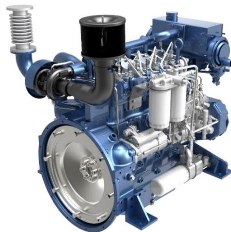
This picture is for reference only and does not represent the actual product status.