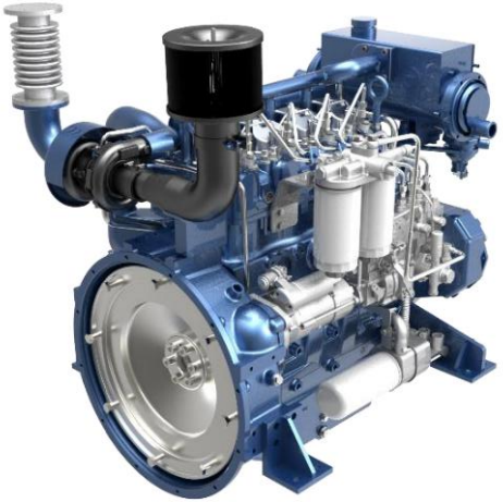
This picture is for reference only and does not represent the actual product status.